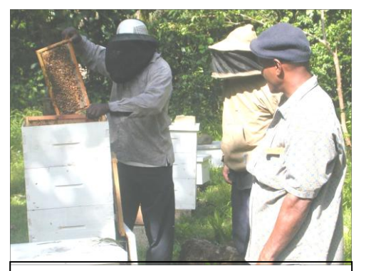
Members of the Charles Town Bee Keeping Association at Training Session

The Institute also arranged technical training in honey production and a workshop series in Conflict Management for the group. During the year, the group hosted its Annual General Meeting, where the executive was able to demonstrate the growth and maturing of the group over its one year existence.