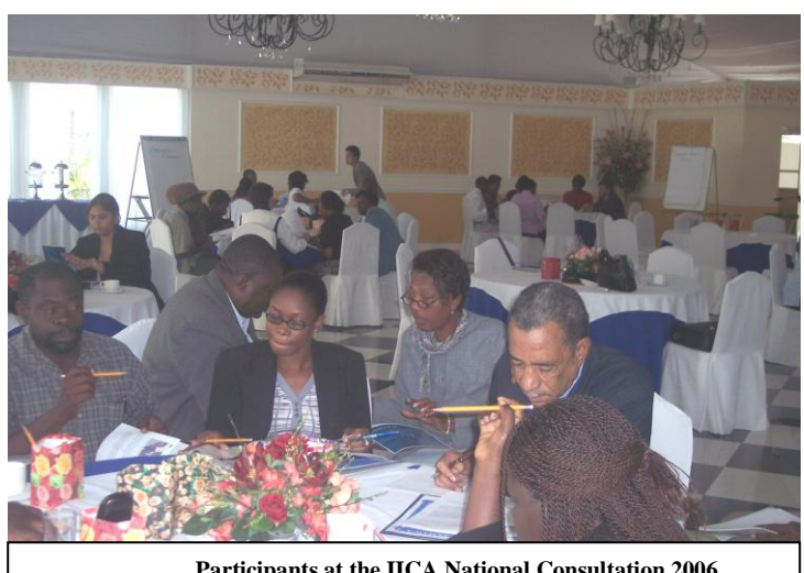
Participants at the IICA National Consultation 2006

The National Consultation sought guidance from our associates in the sector toward the drafting of the Office's 2006 - 2010 National Agenda. The Consultation included a presentation of the results of the previous National Agenda (2002 – 2006), as well as a participatory break-out session to ascertain the priority areas for IICA's technical cooperation in the sector.