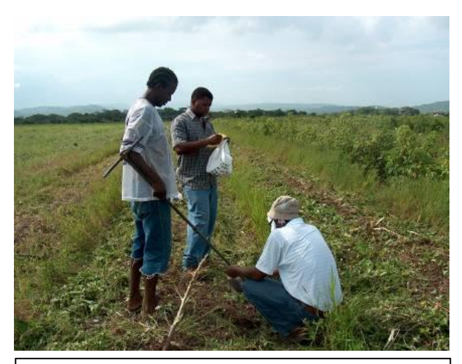
Cotton Farmers receiving in-field training under the Farmer-to Farmer Programme