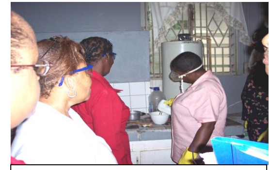
JNRWP members at Soap Making training workshop

of the Government of Jamaica (GOJ)/ Organization of American States (OAS) – Rural Women in Agriculture;